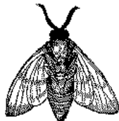
Figure 2: A sample black and white graphic (.pdf format) that has been resized with the includegraphics command.

As was the case with tables, you may want a figure that spans two columns. To do this, and still to ensure proper “floating” placement of tables, use the environment figure* to enclose the figure and its caption.